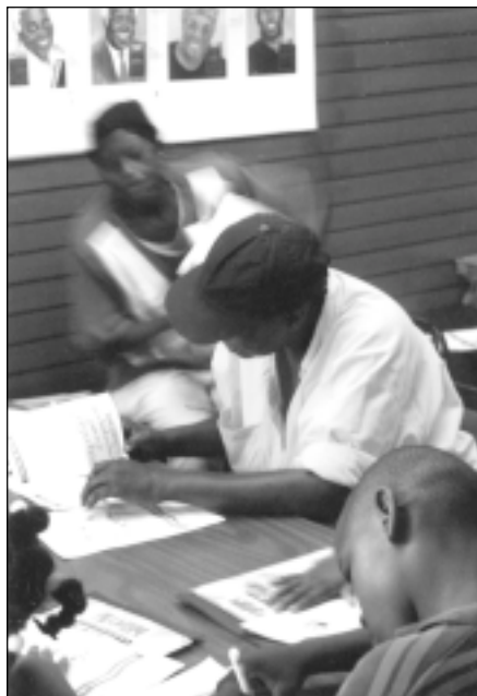
Education during summer camp.

Hope Manna in collaborations with other LITERACY advocates is happy to announce that after three years of speaking out for the illiterate, efforts are being made to bring a solution to this problem. The GED Preparation Class is still available to assist individuals eighteen and above to prepare to take the Test. Tutors are needed for the Literacy and GED Preparation Classes.