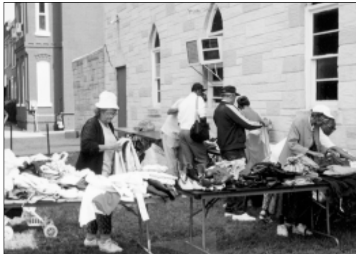
Clothing distribution .